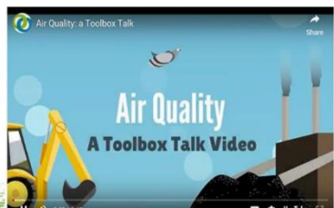
Air Quality: a Toolbox Talk