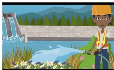
Water: a Toolbox Talk